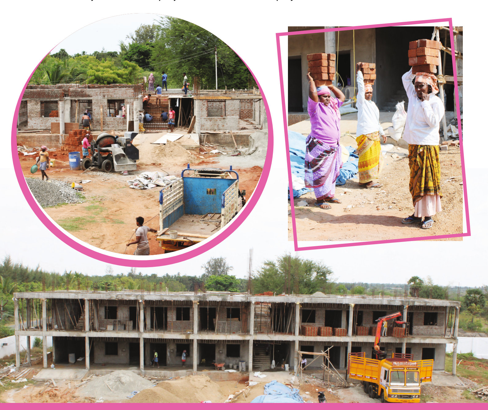
To learn more, visit our website www.eternalwordministries.org

We value your continued prayers for this wonderful project.